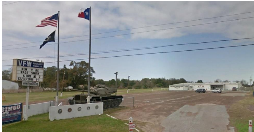
Tomball VFW Post 2427 - 14408 Alice Road, Tomball, Texas 77377