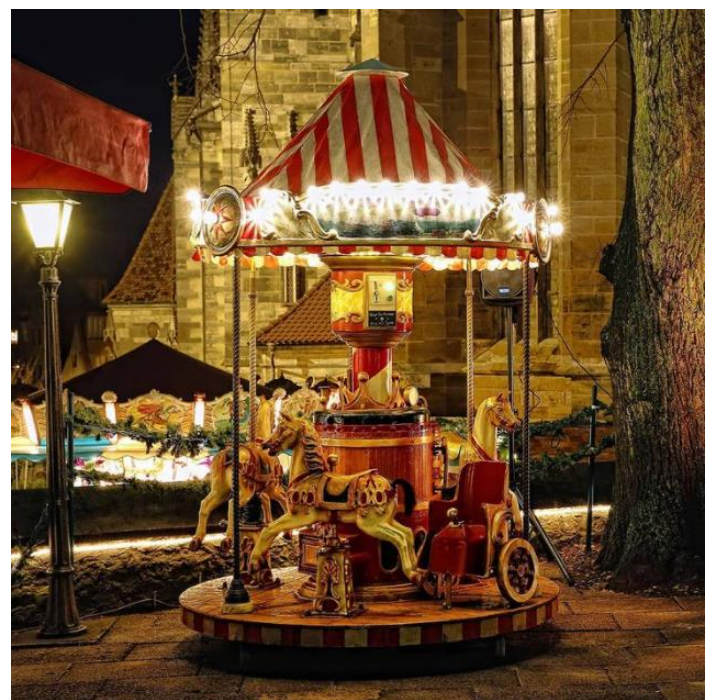
Reiterlesmarkt in Rothenburg ob der Tauber, Germany – Christmas Market

The city lies above the deep valley of the Tauber River, on the scenic “romantic route”. It was first mentioned as Rotinbure in the 9th century. The city is encircled by a many-towered wall and is one of the best-preserved medieval cities in Germany.