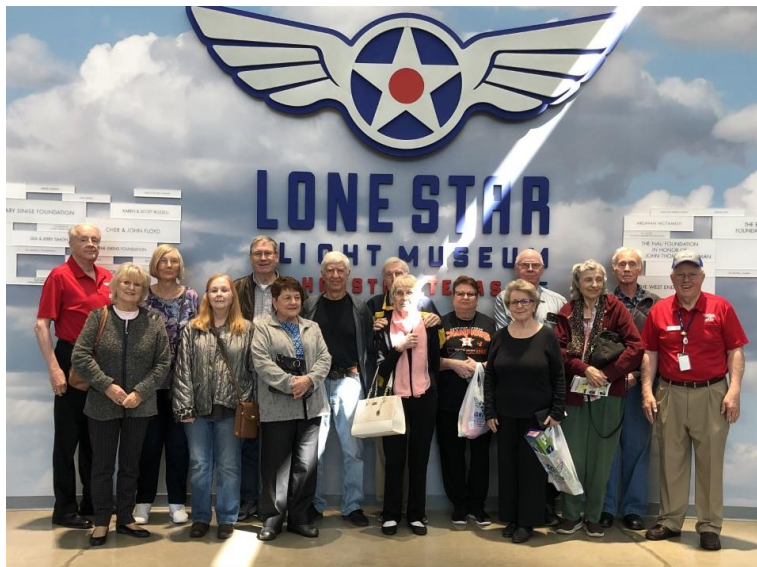
On Thursday, October 27th, 2022, seven members of the Tri County Chapter and six guests toured the Lone Star Flight Museum at Ellington Airport. They were able to get an up close look at the vintage airplanes.