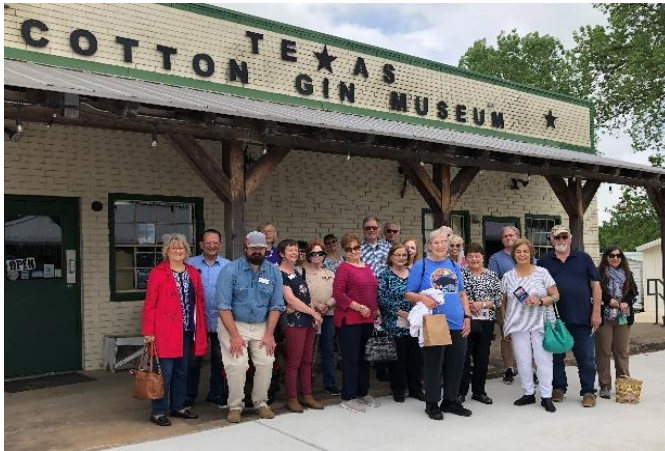
On April 12, 2022, members of the Katy Tri-County Chapter and guests visited the Texas Cotton Gin Museum in Burton, Texas.