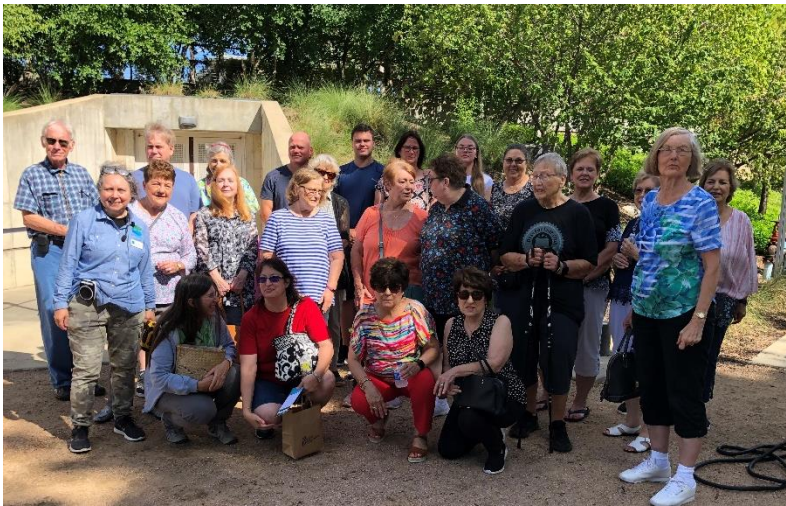
On July 29, 2022, the Katy Tri-County and Fort Bend Chapters and their guests, including visitors from Germany, visited the Buffalo Bayou Park Cistern, had lunch at the Cleburne Cafeteria and visited the Photography Museum in Houston.