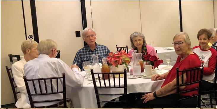
On December 8, 2022, eleven members of the Katy Tri-County Chapter enjoyed a delicious meal at the Brookwood Café.